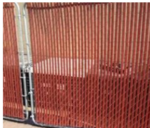
However, some sites prefer slats to hide the bins from the public.