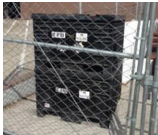
A chain link fence is good security.

When a PaintCare drop-off site keeps its storage bins outside, the bins need to be secured from access by the public. Only drop-off site employees should have access to the collection bins and storage area. Drop-off sites should be secured and locked when the drop-off site operator is not open for business or the site is unattended.