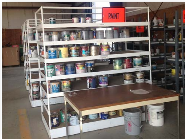
Reuse room at the Household Hazardous Waste Facility at the Yolo County Central Landfill in Woodland, CA.

Any PaintCare products (qualifying paint, stain and varnish as defined by PaintCare – please see www.paintcare.org/products-we-accept ) that are distributed through these reuse programs must be in their original container, have an original label, and be in good physical and aesthetic condition. Contents must be liquid and relatively new. Containers should be closed securely before being placed in the reuse storage area. Customers must sign a waiver form explaining that the paint is taken “as is” with no guarantee of quality or contents. The customer is required to read, complete and sign the form, and site staff members are required to verify and record what has been taken by the customer.