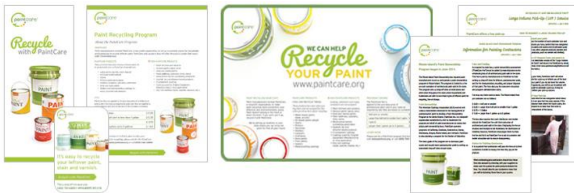
Brochure, Mini Card, Program Poster, Counter Mat, Painting Contractor Fact Sheet, LVP Service Fact Sheet

PaintCare has developed these print materials to promote the program and will continue to distribute them for use by paint retailers, other types of drop-off sites, and others (e.g., government offices, real estate agents). Illustrations of these materials are shown here: