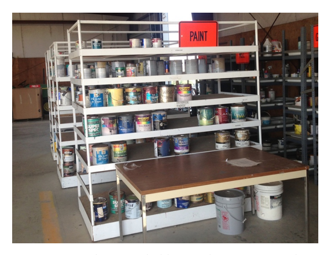
Reuse room at the Household Hazardous Waste Facility at the Yolo County Central Landfill in Woodland, CA.

Customers must sign a waiver form explaining that the paint is taken "as is" with no guarantee of quality or contents. The customer is required to read, complete, and sign the form, and site staff members are required to verify and record what has been taken by the customer. If a reuse facility does not use a waiver form, the facility accepts the liability for the materials. The staff must record the number of containers taken by each participant and the total estimated volume on the log.